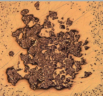
Figure 1: Re-polished sample with pre-spark crater