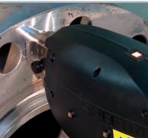
UV test probe (arc/spark operation)

Battery drawer; up to 800 measurements on a single charge