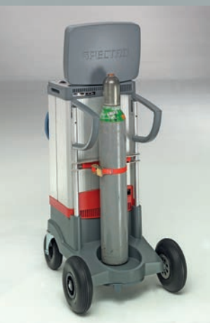
Freely accessible argon bottle for rapid replacement